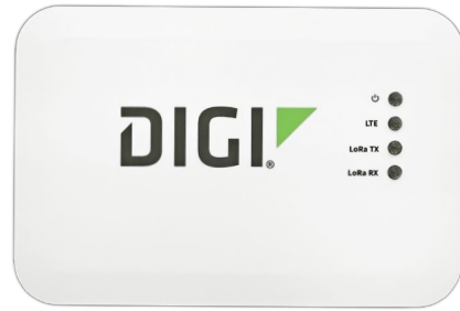
Digi HX15 Gateway – back