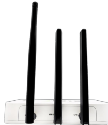
Digi HX15 Gateway – back