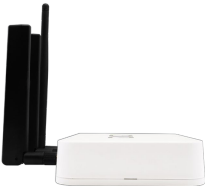
Digi HX15 Gateway – left